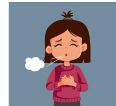
Take deep breaths

Everyone feels angry, upset or worried at times. There are different things we can do to feel calm again when these emotions appear: