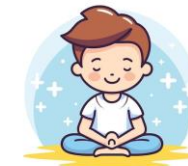
Take a time-out